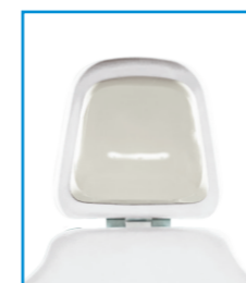
C95 Gel Appeal

Magnetic Gel Appeal Pillow adapts to the physical structure of every person, absorbs and distributes head and instrument pressure over the entire contact surface. Long and pleasant sensation of freshness during treatment.