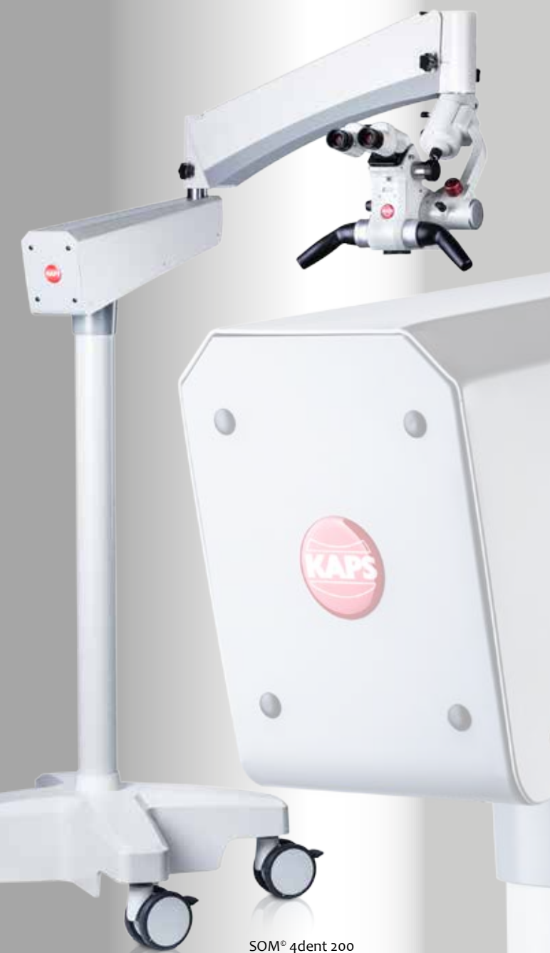
SOM® 4dent 200