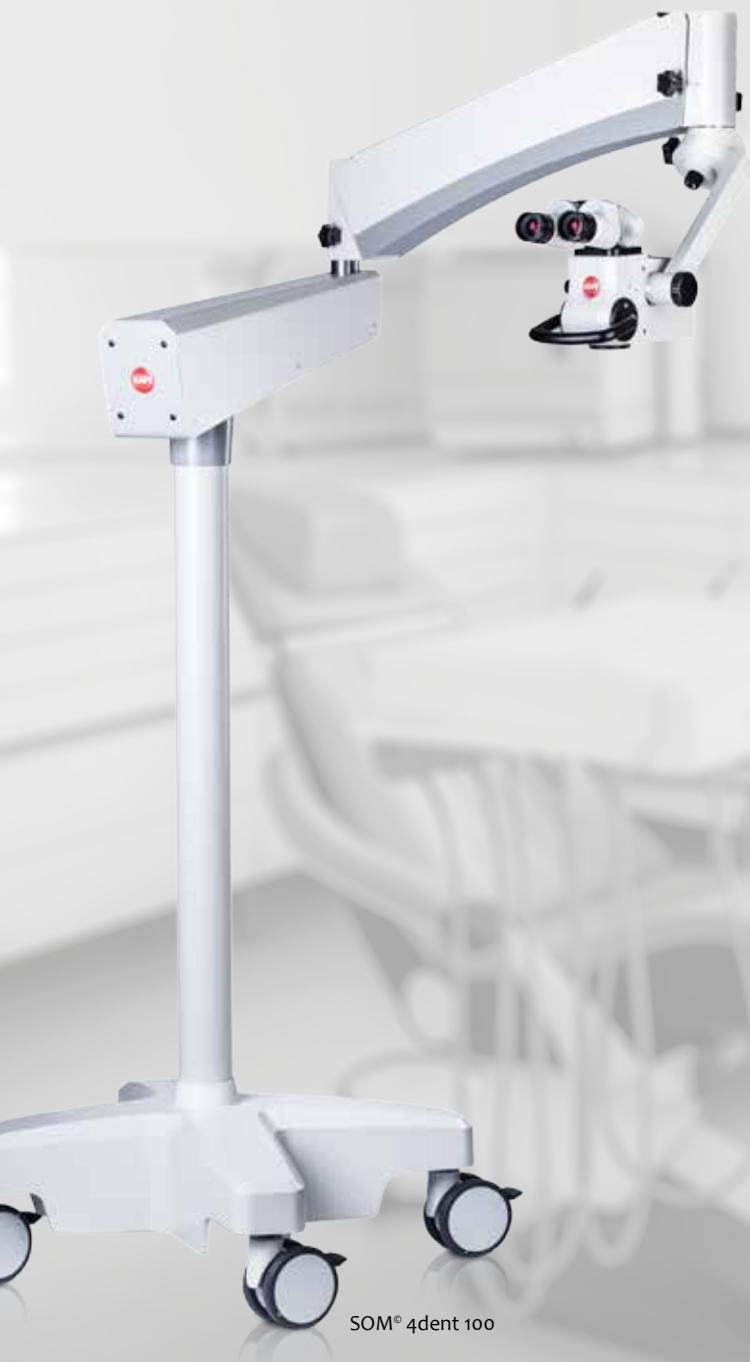
SOM ® 4dent 100

The new SOM ® 4dent range of Karl Kaps dental microscopes stands for ergonomics and quality.