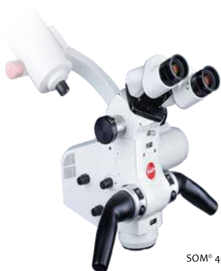
SOM® 4dent 300

The Kaps SOM® 4dent dental microscopes are also ideal for joint practices. Through the use of an ergonomic handle, varioscope and inclinable tube, several users can work with the microscope without time-consuming retooling, and everyone continues to benefit from an ergonomic working environment.